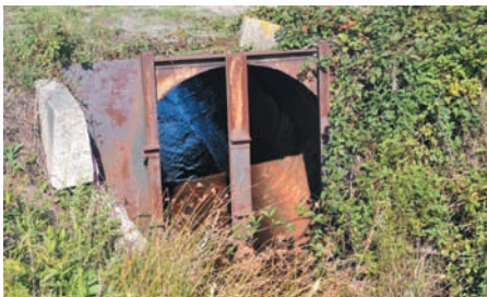
Old flumes like this one will be removed or replaced when restoration is completed.

A great diversity of wildlife including unusual creatures such as this pink katydid, shown at right, live in the Bank Street Bogs Nature Preserve.