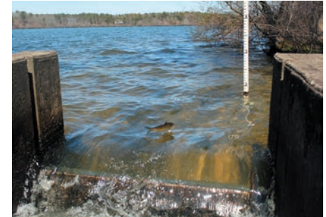
Feisty river herring swim upstream - with some going airborne in the process (see above).

Now in its fifth season, the annual Herring Count Project is just starting to ramp up. Volunteers once again have amazed us with their enthusiasm and dedication. Last year's run estimate was more than 101,000 river herring compared with 10,000 in 2011, 41,000 in 2010 and 19,000 in 2009. While 2011's count concerned us, it was encouraging to see the numbers greatly increase the next season. We hope to report more good news following this year's run. Learn more about this program and recent updates at: www.HarwichConservationTrust.org .