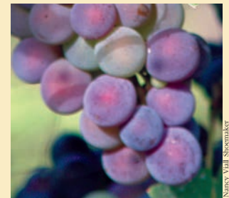
Nancy Vall Shoemaker

Cape Sea Grille Winetasting page 2 Reserve for Live Raptors page 3 Reserve for 25th Anniv. Annual Mtg. p. 3 Wildlands Musical Stroll page 3 Saving Land: Saquatucket Watershed p. 4 Saving Land: Cahoon Canal page 6 Citizen Science: Birds & Eels page 8 Citizen Science: Herring page 9 Business Support page 9 Memorials/Gifts pages 10 & 11 Leave a Legacy back cover