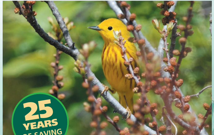
Yellow Warbler by Gus Romano